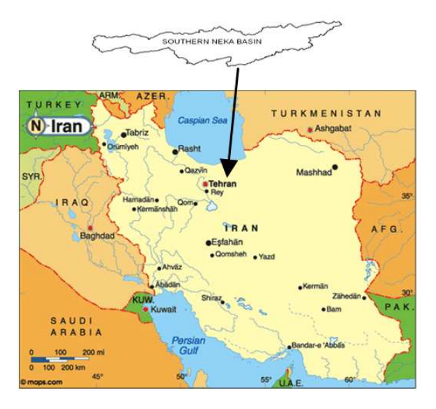
Fig. 1: Geographic location of Southern Neka Basin

To quantify land cover-land-use change land-cover patterns were interpreted on sequential black and white panchromatic aerial photographs (1955, 1965 and 1994), corresponding to the Southern Neka basin and the surrounding area. Aerial photography approximate scales were, respectively, 1:55,000, 1:50,000 and 1:20,000.