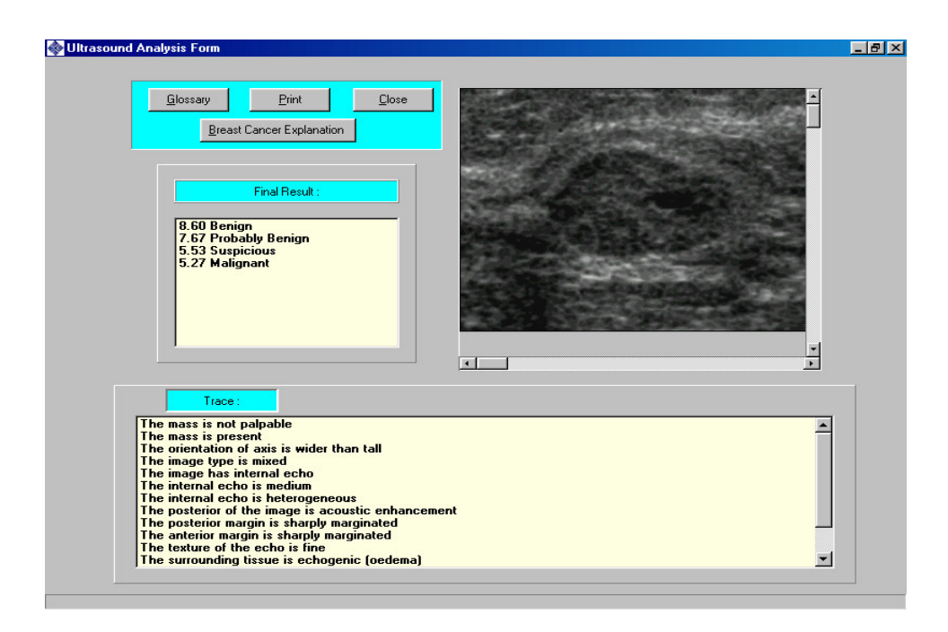
Fig. 4: The screen display of the breast ultrasound image based expert system.