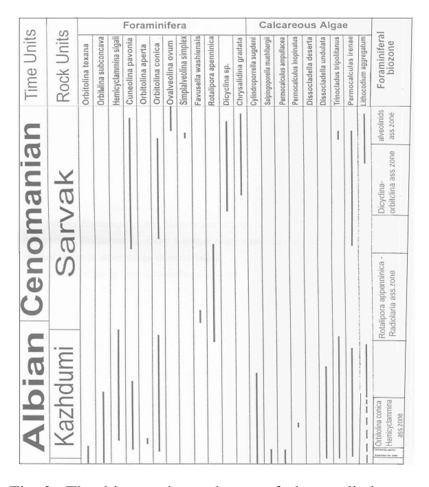
Fig. 2: The biozonation scheme of the studied areas showing the zones and stratigraphic distribution of main microfossils

Distribution: Kuh-e-Naghsh-e-Rostam, kuh-e-siyah, Sarvak Formation.