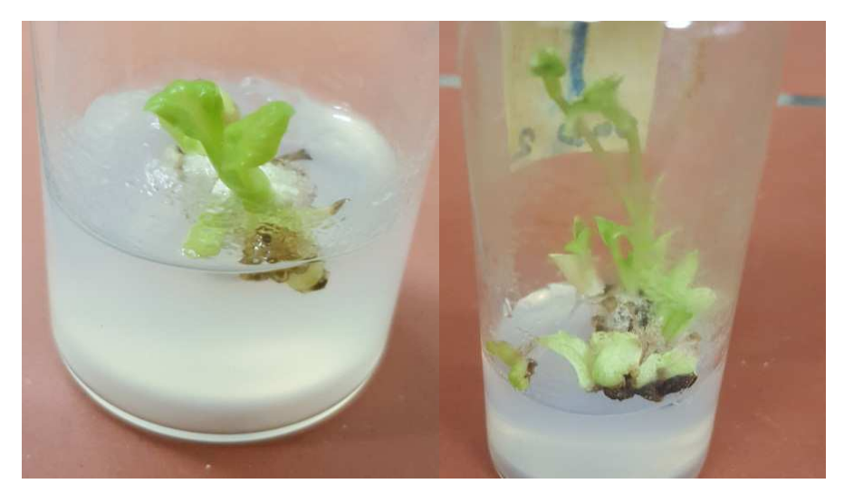
Fig. 2: In-vitro regeneration of multiple shoots from calli of Datura inoxia

Fig. 1: In-vitro callus induction from different explants of Datura inoxia (a) leaf cut explants (b) stem cut explants