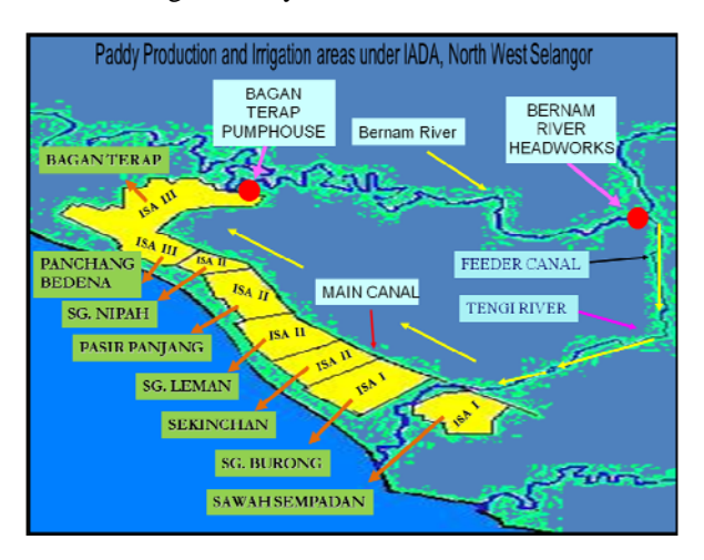
Fig. 3: Geographical Distance among the Paddy Production and Irrigation Areas under IADA in North-West Selangor, Malaysia

Fig. 2: Standard Deviation of the Monthly Rainfall Data across the Areas under IADA in North West Selangor, Malaysia