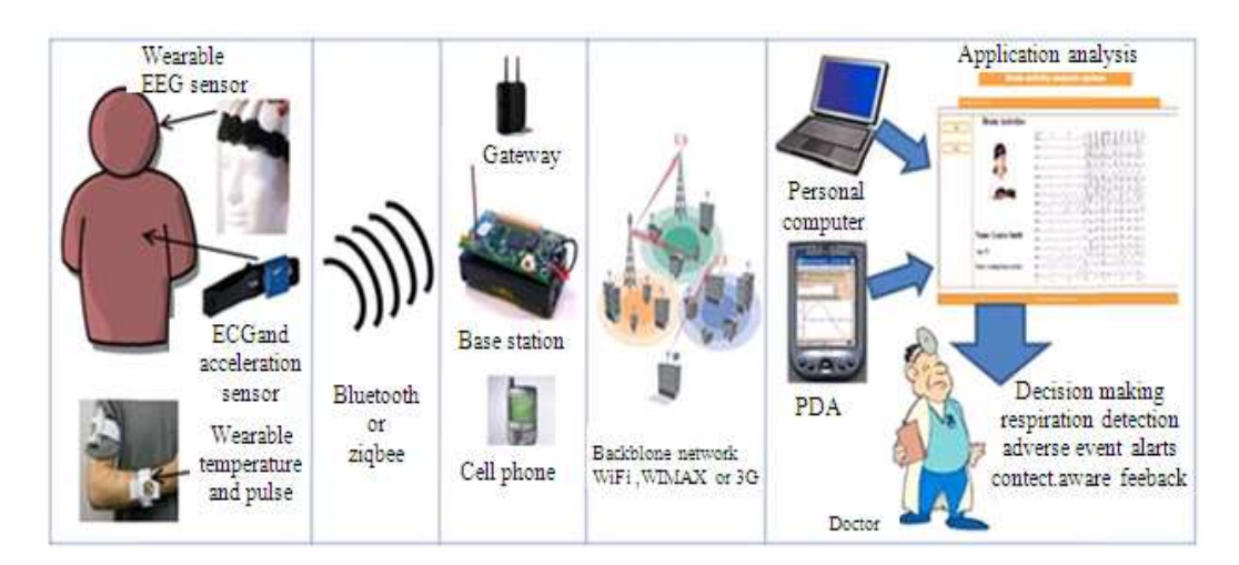
Fig. 1: WBASNs signal process ding and communication framework