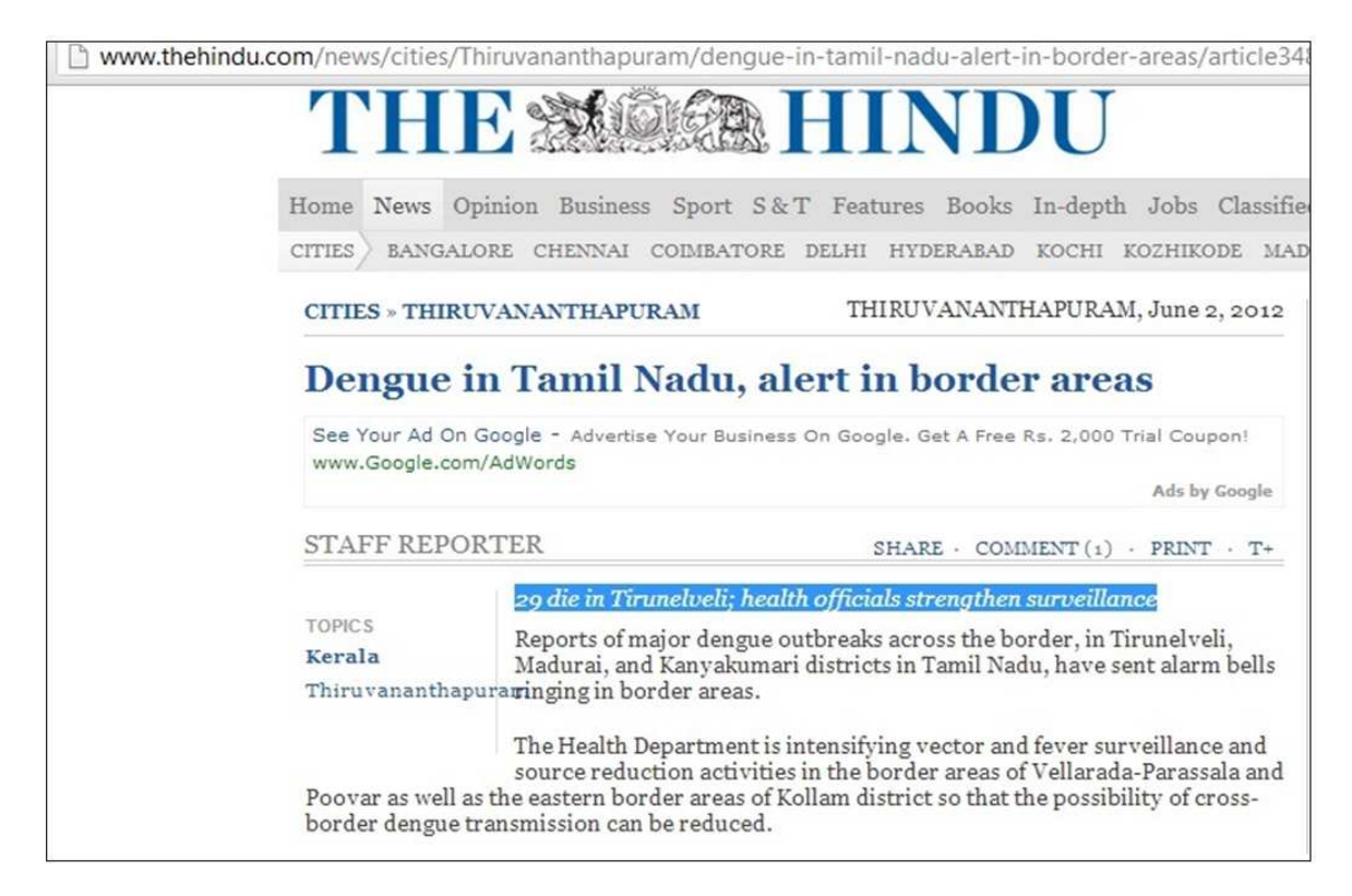
Fig. 1. Web page which shows the dengue fever details of Tirunelveli District