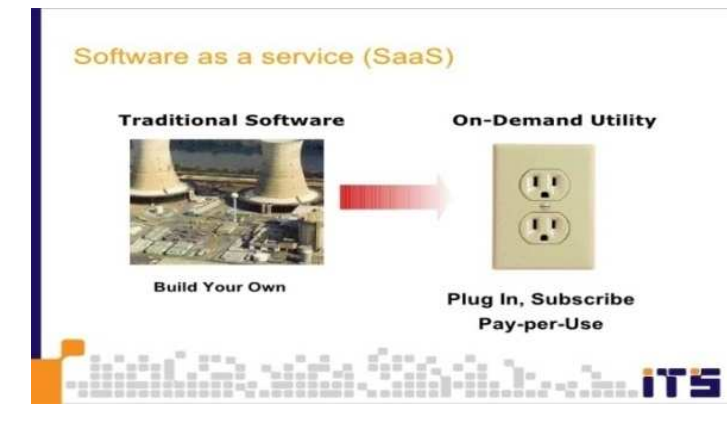
Fig. 1. On-demand SaaS (Derek, 2011)

system down totally. In SaaS solutions if a problem occurs for a customer and then fixed by provider, the problem automatically has been fixed for every one without any upgrade fee (Alsahhar, 2009).