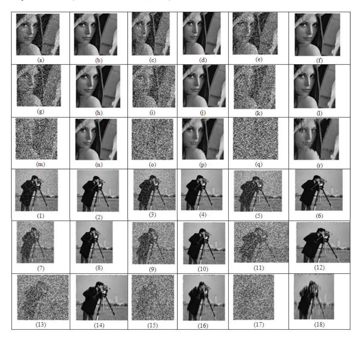
Fig. 2. Qualitative results of the proposed algorithm for Lena and cameraman images for the noise densities from 10 to 90%, (a, c, e, g, i, k, m, o, q represents corrupted Lena images from 10 to 90% respectively and b, d, f, h, j, l, n, p, r represents corresponding restored images), (1,3,5,7,9,11,13,15,17 represents corrupted cameraman images from 10 to 90% respectively and 2,4,6,8,10,12,14,16,18 represents corresponding restored images)

Figure 2 shows the visual qualitative results of the proposed algorithm for Lena and cameraman images for the noise densities from 10 to 90%. The qualitative performance also claims its effectiveness of good restoration and it is outperforming than other existing filtering algorithms.