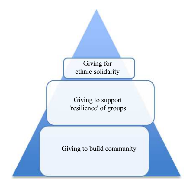
Fig. 2: Hierarchy of motivations- Remittances and philanthropy