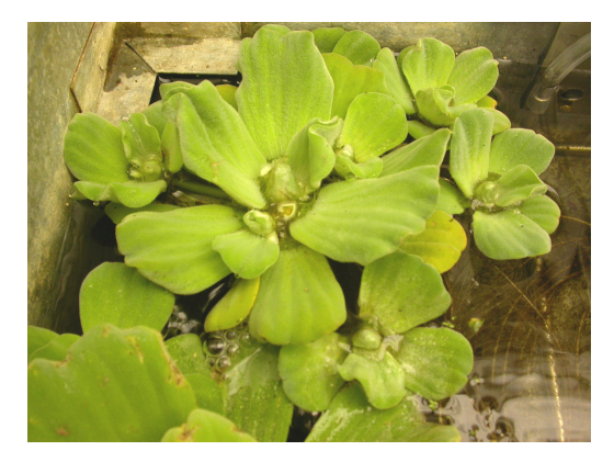
(b) water lettuce