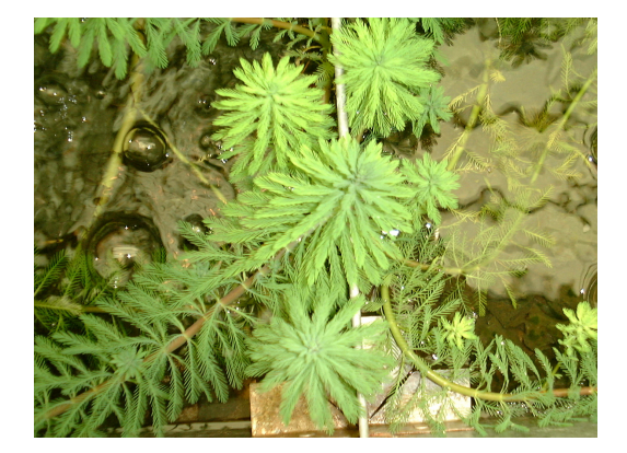
(c) parrot's feather

Fig. 3: The aquatic plants at day 14 of the experiment