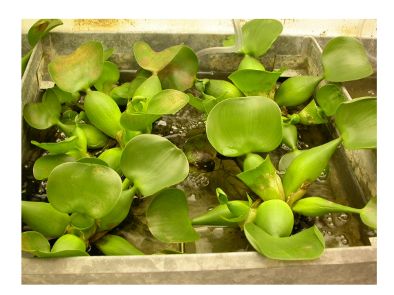
(a) water hyacinth