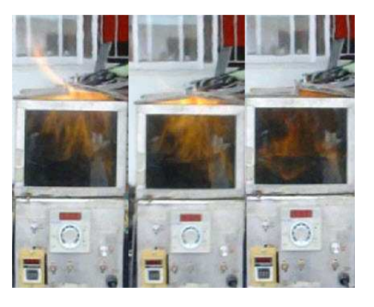
Fig. 4: Shows the test of flammability at 145 sec