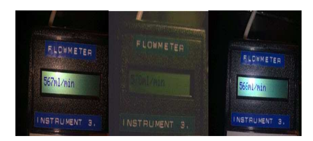
Fig. 6: Shows the measurement of flow rate of fuel through the test chamber by using the flow meter