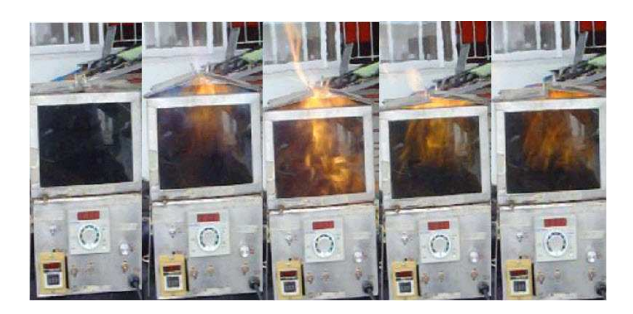
Fig. 5: Shows the test of flammability at 165 sec

The volume is 0.34 L or the fuel is 1.67% of air in the test chamber from the 3rd test. The flammability limits continue to expand until the maximum level at 180 sec in which the volume is 1.49 L or the fuel is 7.5% of air in the test chamber. The test results are shown in Table 2.