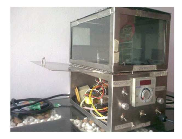
Fig. 2: Shows the test chamber