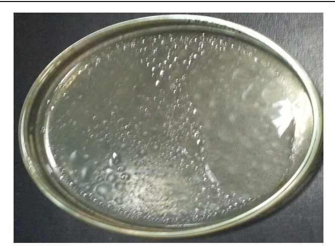
Fig. 4. The antifungal effect of Thyme oil against A. fumigatus ; recovered from cattle, at a concentration of 0.25% showing complete inhibition of the growth

Radwan, I.A. et al. / American Journal of Animal and Veterinary Sciences 2014, 9(4): 303.314 DOI: 10.3844/ajavssp.2014.303.314