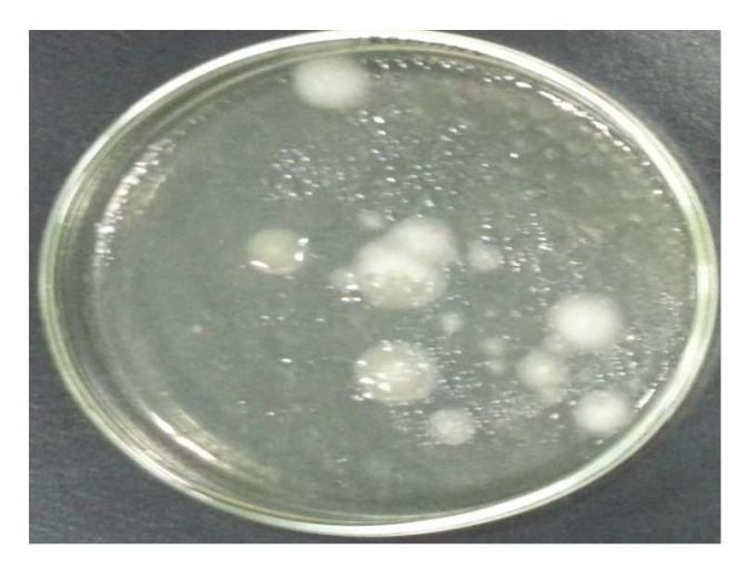
Fig. 5. The antifungal effect of Clove oil against C. albicans ; recovered from human, at a concentration of 4% showing constricted growth of the colonies appeared after the 4th day of incubation

Fig. 4. The antifungal effect of Thyme oil against A. fumigatus ; recovered from cattle, at a concentration of 0.25% showing complete inhibition of the growth