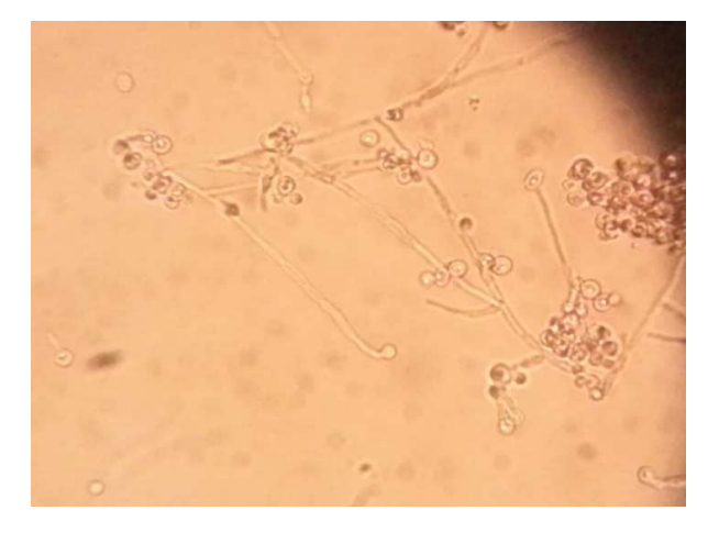
Fig. 2. Germ tube formation of C. albicans under microscope. Germ tubes appear as hypha-like extensions of yeast cells, produced usually without a constriction at the point of origin from the cell

Fig. 1. Chlamydospore production on rice agar medium under microscope yeast cells appear as spherical clusters at regular intervals on pseudohyphae and having the chlamydospores on the pseudohyphae like shiny pearls