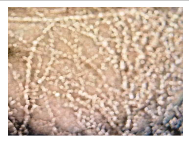
Fig. 1. Chlamydospore production on rice agar medium under microscope yeast cells appear as spherical clusters at regular intervals on pseudohyphae and having the chlamydospores on the pseudohyphae like shiny pearls

Radwan, I.A. et al. / American Journal of Animal and Veterinary Sciences 2014, 9(4): 303.314 DOI: 10.3844/ajavssp.2014.303.314