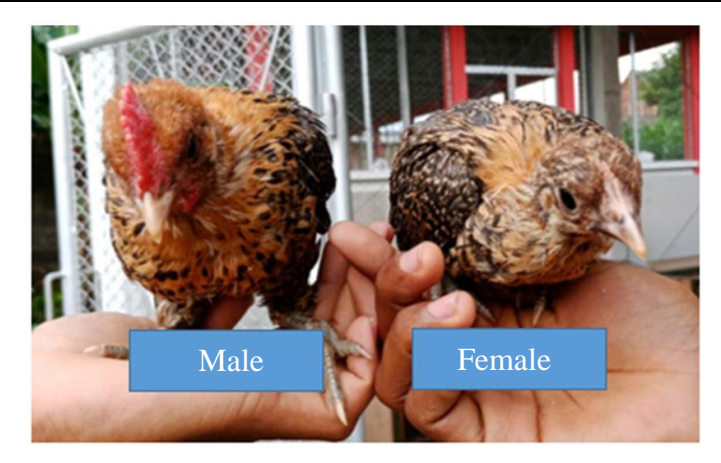
Fig. 2: The differences in the secondary sex signs of 4 weeks old Arabic Gold chicks. Male Arabic chicks show red and thicker combs, while female Arabic chicks have thinner combs

Iswati et al. / American Journal of Animal and Veterinary Sciences 2021, 16 (1): 48.55 DOI: 10.3844/ajavsp.2021.48.55