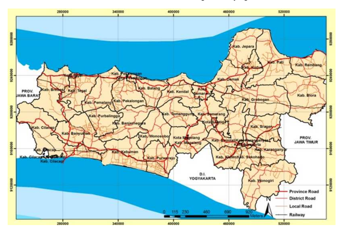
Fig. 1. Map of CENTRAL Java Province, Indonesia

Implementing the RAD-GRK is an additional task for all the stakeholders, including the CJPG. This additional task is of two kinds: (1) New work or program that has never been done before and (2) refinement of the existing work or program.