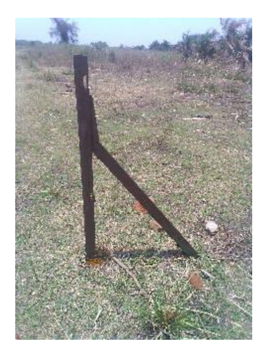
Fig. 2: Dysfunctional gauge at Thedzi Village along the Shire River

There are also operational gauges along the RS at Kamuzu bridge and in Thedzi village to monitor discharge. However, the Thedzi river gauge (Fig. 2) was vandalized and therefore, could not be used to forecast the flood in 2019.