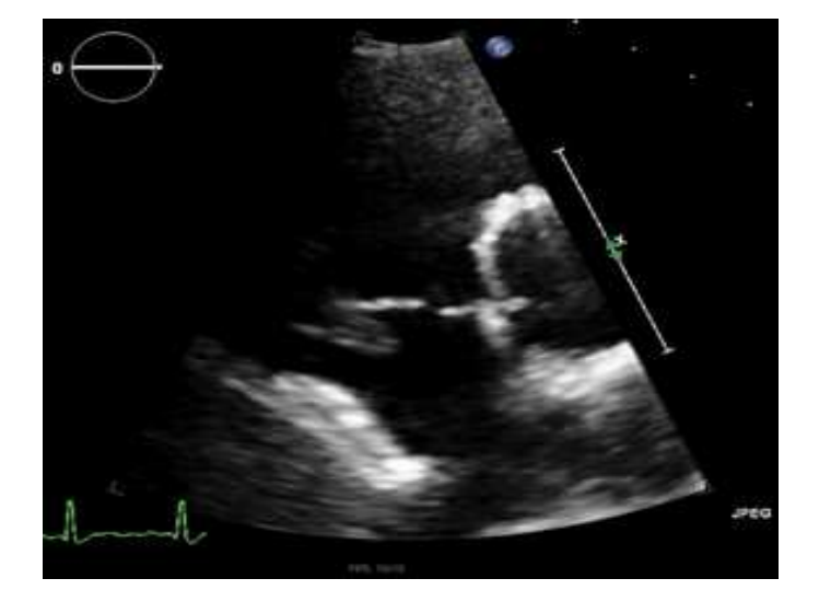
Fig. 1: Transthoracic echocardiogram ejection fraction = 60-65%. There is trace mitral regurgitation. There is mild tricuspid regurgitation. Mobile echodensity on the tricuspid valve consistent with vegetation, measuring 1.5 cm

patient bronchoscopy The underwent with (BAL) bronchoalveolar lavage and therapeutic thoracoscopy with drainage and thoracostomy tube placement on day 8 of hospitalization. Sero-sanguineous fluid was noted in the tube drain. Chest tube remained in place for 48 hr and was removed without complication. BAL cultures were reported growing AFB as well. At this point, linezolid was added to the regimen. Multiple sets of blood cultures drawn during the hospital course were negative after starting combination antibiotic therapy. Pleural fluid AFB cultures remained negative. Drug susceptibilities were available 3 weeks later (performed at University of Texas Health Science Center in Tyler, TX). The isolate was reported susceptible to amikacin. Linezolid, imipenem and cefoxitin were reported to have intermediate activity and TMP/SMX, ciprofloxacin, moxifloxacin, doxycycline, minocycline and clarithromycin were reported resistant (Table 1).