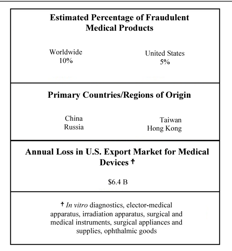
Fig. 1: Estimates related to the percentage of fraudulent medical products, the documented primary countries/regions of origin for counterfeit products and the annual loss to the U.S. export market for medical devices