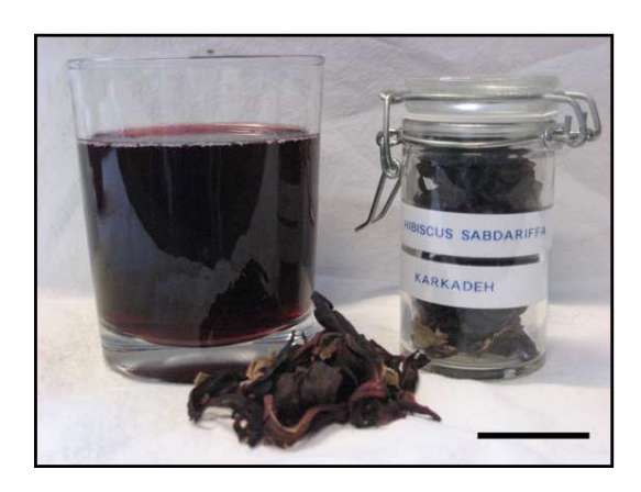
Fig. 1: Dried petals of Roselle, known in Arabic as "Karkadeh" ( Hibiscus sabdariffa Linn)-collected from the Aswan region of Egypt. The photo was taken using a Canon Digital Ixus 60 camera with 6.0 megapixel resolution, on the 30th of April 2008; shutter 1/60, f/3.5, focal length 8.4 mm. Scale bar = 5 cm

In Egypt, during the hot summer months, numerous traditional drinks such as karkadeh are consumed and are known to have a beneficial effect on human health<sup>[16]</sup>. However, a decreasing preference for the old and more traditional ways and a move towards an increasing use of commercially produced carbonated drinks, soft drinks and fruit nectars has resulted in elevated blood glucose levels with deleterious effects to the health and well-being of the general populace<sup>[16]</sup>.