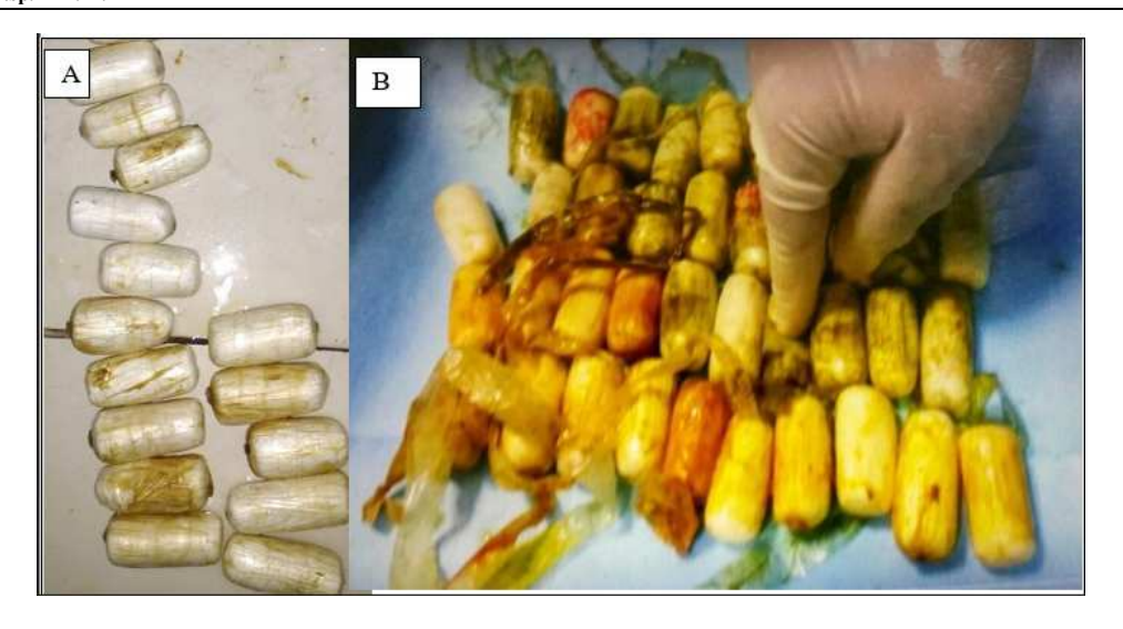
Fig. 2. (A) Multiple oblong shaped intact Heroin packets passed in stool, (B) similar packets removed after laparotomy with few of them ruptured