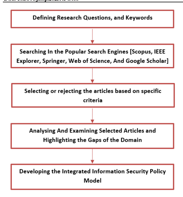
Fig. 1: The research methodology and the development process

Selecting or rejecting the articles based on specific criteria: In this stage, authors put some criteria to select the relevant articles which focused on the ISP domain purely. Thus, the authors follow these criteria adapted from (Al-Dhaqm et al. , 2020a; Panda and Jana, 2015):