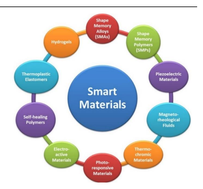
Fig. 1: Smart materials used in the 4D printing field

One of the most important and widely used SMPs is Polyurethane (PU) based SMPs. These polymers have a good thermal response, mechanical properties, and processability, making them suitable for various applications such as biomedical engineering and 4D printing. PU-based SMPs have been used to create self-assembling and self-healing structures, drug delivery systems, and even robots. Additionally, PU-based SMPs have been used in the field of textiles, creating smart fabrics that can change shape and properties in response to temperature or light (Sikdar et al. , 2022; Du et al. , 2022).