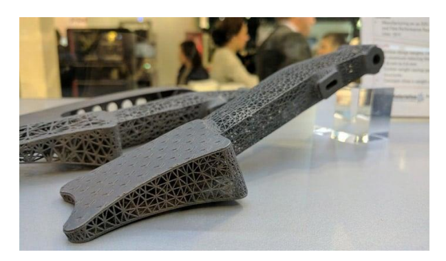
Fig. 3: Additive manufactured automotive part (Carlota, 2022)

The medical field is also a potential application of 4D printing and smart materials (Wang et al. , 2022b; Osouli-Bostanabad et al. , 2022; Mallakpour et al. , 2022; Kantaros and Piromalis, 2021b; 2022; Kantaros et al. , 2021; Kantaros, 2022a-b). 4D printing and smart materials are revolutionizing the field of medicine, enabling medical researchers and practitioners to create medical devices and implants that are not only more effective but also more adaptable to the patient's body. 4D printing technology allows researchers and practitioners to embed smart materials into the design of medical devices and implants, giving them the ability to change shape, properties, or functionality over time in response to the patient's body. Figure 4 depicts a computer image of 4D printed airway splints, which grow over time to help babies breathe.