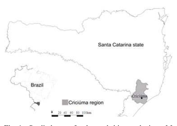
Fig. 1: Studied area of arthropods bites and stings. Map of Brazil with the location of Santa Catarina state and Criciúma region

Criciúma region (Fig. 1) is the socioeconomic province composed by folloing 11 municipalities: Içara, Lauro Müller, Morro da Fumaça, Nova Veneza, Siderópolis, Urussanga, Forquilhinha, Cocal do Sul,