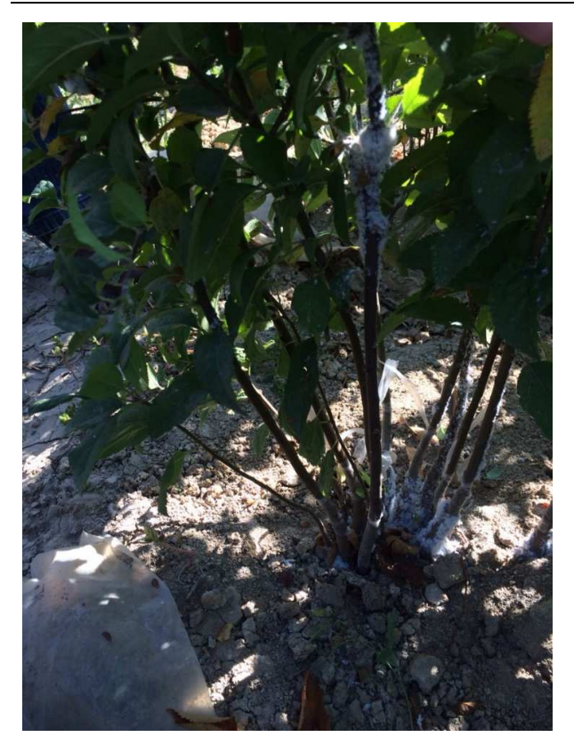
Fig. 1:Damage to seedlings of red woolly aphids ( Eriosoma lanigerum Hausm.) in apple tree nurseries

The larvae of the first and second age pass the winter on the roots of trees, where from 68.7 to 82.4% of the total population are concentrated in Kazakhstan. A somewhat different pattern in the distribution of wintering aphid populations was observed in the foreststeppe of Ukraine. Here, from 53.9 to 62.4% are concentrated on the roots of trees, which is explained by higher air temperatures in Ukraine. It is also significant that from 56.3 to 72.8% of wintering aphid larvae, which are concentrated on the trunks of seedlings on the soil surface, are destroyed by the spring reactivation period. Sudden changes in air temperature and humidity are the main cause of destruction. In addition, the physiologically weakened portion of the aphid population is concentrated here. Spring reactivation of larvae occurs in spring at soil temperature in the crown region of 8-10°C. The process of migration of larvae is long. According to our studies, the duration of the mass migration period was 7-10 days. In tree crowns, their trophic activity is activated at a temperature of 15-17°C. The duration of the larval period of the overwintered generation is 18-27 days. The least long period of development of one generation is observed in late June and mid-August. For Ukraine, this period is 10-12 days, for Kazakhstan - 12-14 days (Iperti, 1974; Hurpin, 1974; Lyon and Goldlin, 1974).