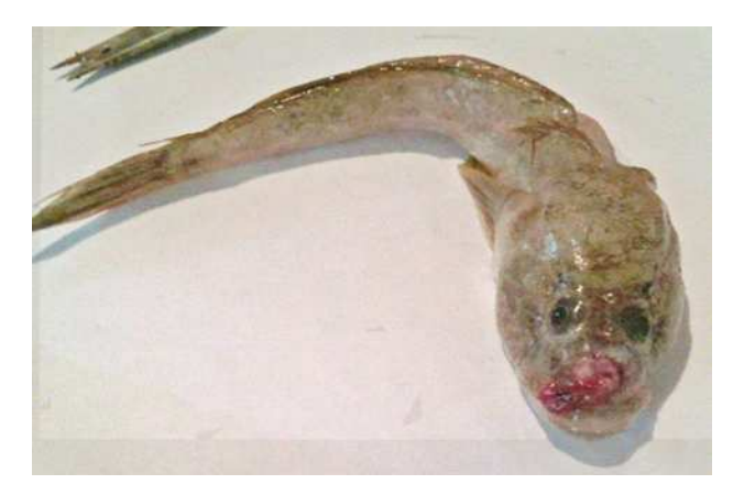
Fig. 4: Ulcerative skin lesions in the syrman goby

In the eastern part of the Taganrog Bay, Vibriosis was diagnosed in the syrman goby Neogobius syrman, Vibrio vulnificus and Vibrio fisheri were causative agents of the disease (2011) (Fig. 4). Spring and summer seasonality were characteristic for the disease.