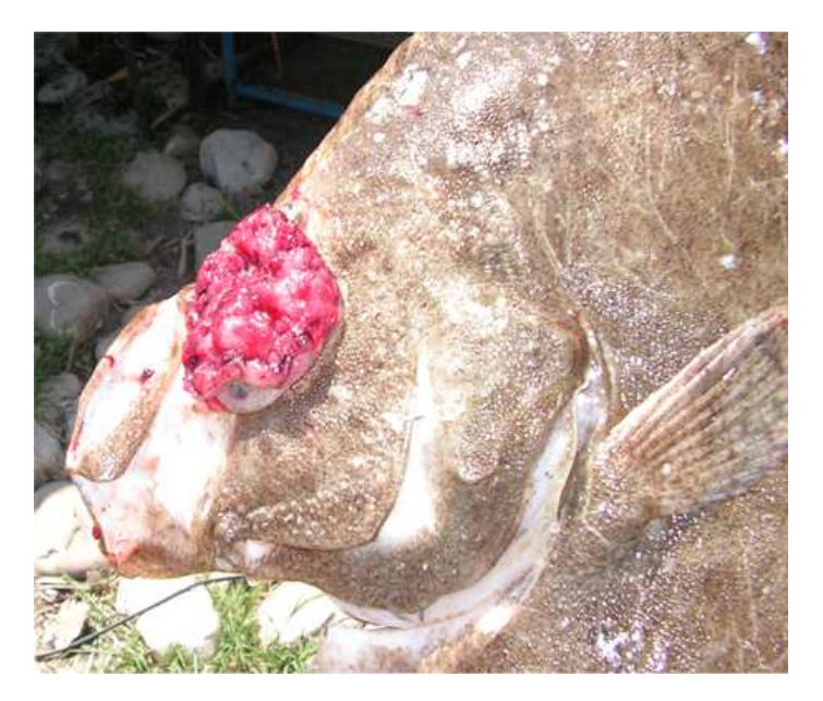
Fig. 5: Turbot with pathology of the skin: papilloma-like neoplasm on the head

Since the spores of SRC that contaminated the gills of turbot (10-100 CFU/g) were not found in the water in the fishing areas, the only source of distribution of these microorganisms were bottom sediments. The greater part of pollutants is concentrated in the sediments and is most actively accumulated by bottom species syrman goby or turbot.