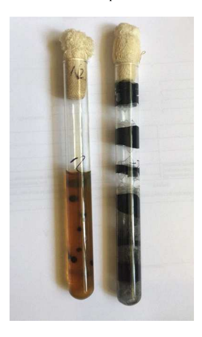
Fig. 3:Cultures of sulfite-reducing clostridia on Wilson-Blair medium

In carp, parenchymal organs (kidneys) from 60 specimens were examined and in patients with specimens, an additional seeding was made from skin ulcers. Bacteriological studies consisted the primary pathogen isolation of samples and identification of bacteria. Mediums of nutrient, of selective and differential (Nutrient Agar with 1% peptone, Nutrient Broth, Hottinger Broth, Endo, Aeromonas Isolation Medium. MacConkey Agar, Vibrio Agar) were used in bacterial inoculation of the clinical samples of tissue and isolation of pure bacterial cultures (Instruction book..., 1998; Weyant et al. , 1999;