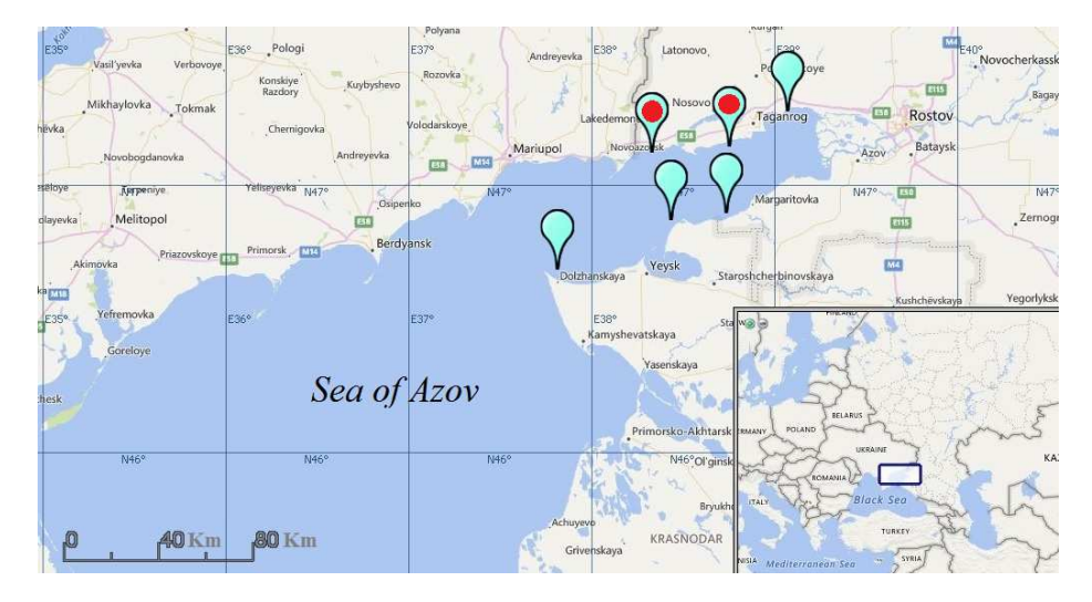
Fig. 1: Scheme of water and fish sampling stations in the north-eastern part of the Taganrog Bay of the Azov Sea; Note: sampling stations marked in red are locations where symman goby with vibriosis were found

Microbiological studies of commercial carps were carried out in two fish farms of the Southern region from 2016 to 2018. Clinical examination, autopsy, microbiological analysis was performed according to standard methods (Kanaev, 1973; Labinskaya and Volina, 2008; Instruction book instructions..., 1998). The biomaterial for the study was collected from living fish at least 10-15 specimens from each studied species. In commercial fish from the Azov and Black Seas, microbiological analysis of liver samples, a section of the intestine with the contents of the gills, muscle tissue and blood were performed. Microbiological cultures were performed from 600 specimens of commercial fish (clinically healthy and with ulcerative skin lesions) and from 43 water samples.