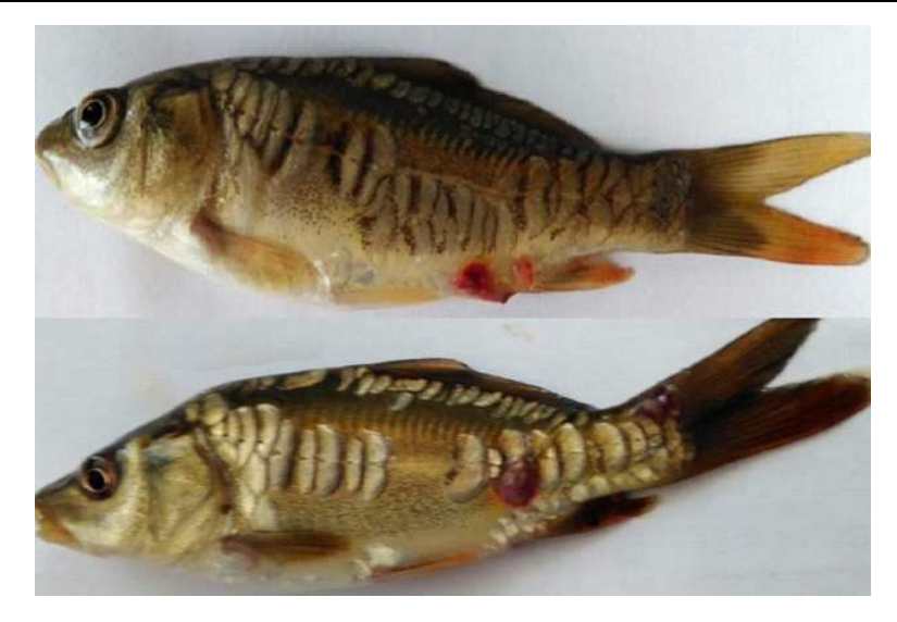
Fig. 6: Carps with manifestations of aeromonosis

It is known that ulcers and tumor skin neoplasms are often noted in fish living in discharge zones of toxic wastes of enterprises, as well as when requirements of industrial rearing are not met (Mikryakov et al. , 2000; 2008). Further study is needed of the etiology and diagnosis of the disease of the Black Sea turbot. Much attention is always paid to the microbial factor assessment in the development of pathology. Undoubtedly, the type, number of microorganisms, their pathogenic properties play a significant role in the emergence of complications of the disease and largely determine the nature of its course.