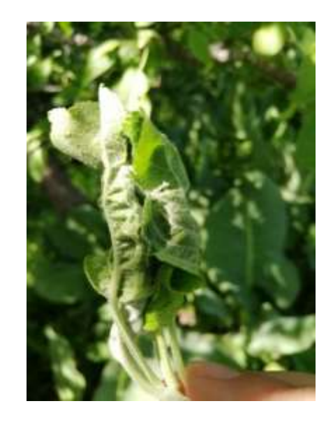
Fig. 1: A. rosana larvae in folds of the apple tree leaves (the site no. 1, the Aksai gorge)

Egg maturation occurs throughout the entire period of the egg laying; it happens periodically at intervals of 2-4 days. The mass oviposition lasts 15-20 days starting from mid July. Eggs are laid on smooth parts of the bark. An egg clutch was observed to contain 55 eggs in average (from 13 to 146 eggs). The first clutches are the most numerous, then they reduce in number. Mainly observed in small clutches, non-viable eggs increase in number to the end of an imago life. Eggs in a clutch are of dark colour; they are laid in tree crutches, in crevices and cavities of the bark (Smirnov and Ovsyannikova, 2012). Clutches were observed to be laid also on leaves.